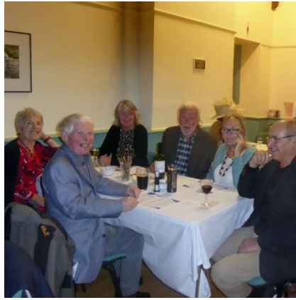
A good time had by all!

Now to the more serious stuff! The indomitable Winsham Shop Management Committee have published a bulletin updating us on the current state of play, and it is all good news! You can read it by clicking on the link below in the e-letter 'table'. What a determined lot we have running the shop-volunteers, staff and management (who are also volunteers). Thanks to these, Winsham Shop and Post Office is safe for the foreseeable future. What we have to do is support it by using it as much as possible.