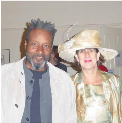
Just like Ascot!