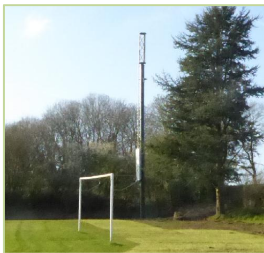
The new Cell net mast has been erected on the Upper Rec. and will provide improved G4 services for users of O2 and Vodafone services. Click on picture for more information.