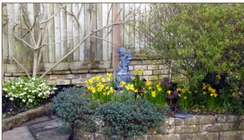
Spring flowers make a tentative start in the garden