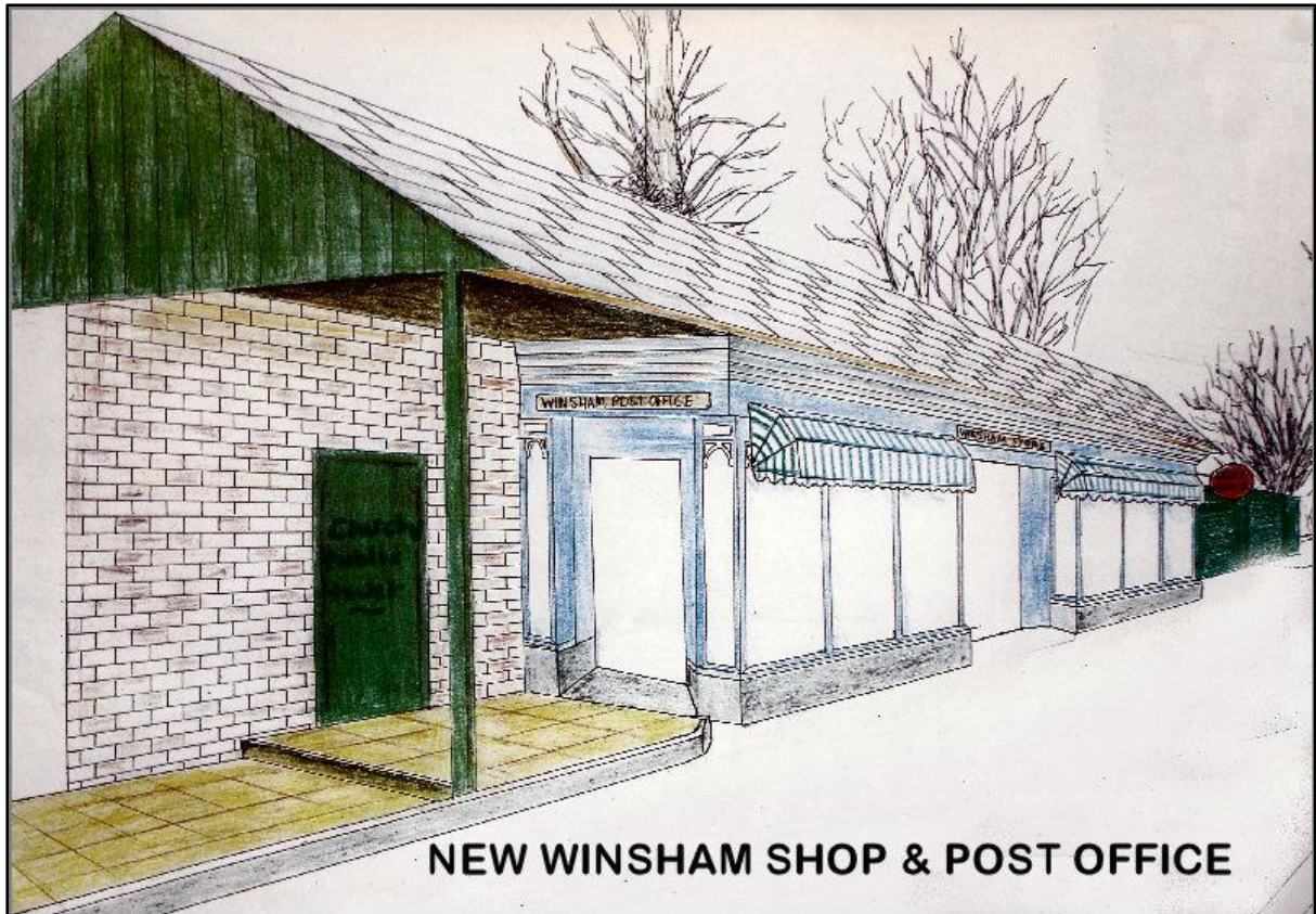
NEW WINSHAM SHOP & POST OFFICE

An impression by Charlie Orr-Ewing of how the new Winsham Shop premises might look if the new project succeeds