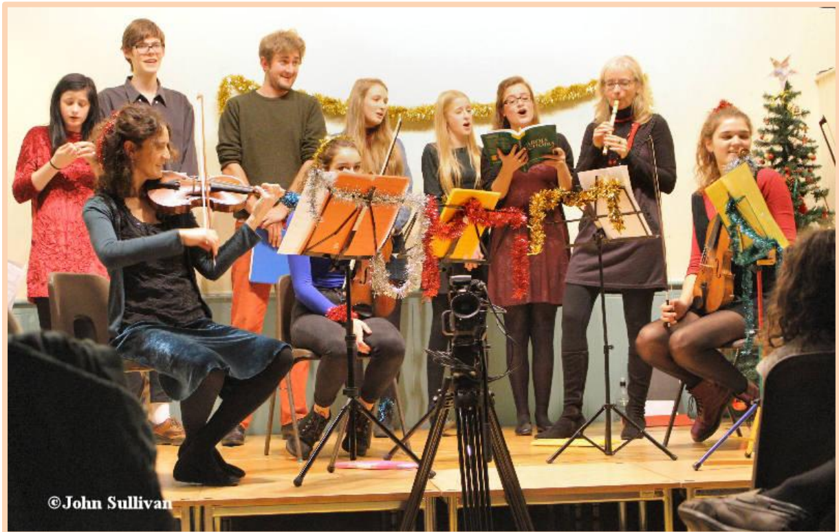
The Christmas Concert in aid of 'Save the Children' Syria Appeal raised £450. Click on the picture to see more.