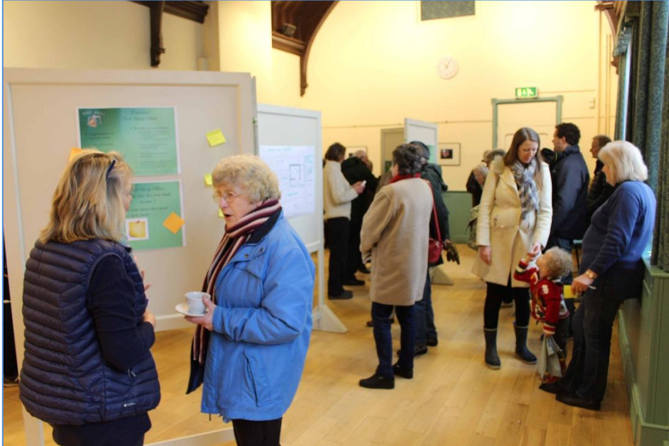
The Winsham Shop/The Bell project Open Day was very well attended on Saturday. The event, on a smaller scale will be replicated at the Jubilee Cafe, this coming Thursday, 16th February, with a further opportunity to have all your questions answered.