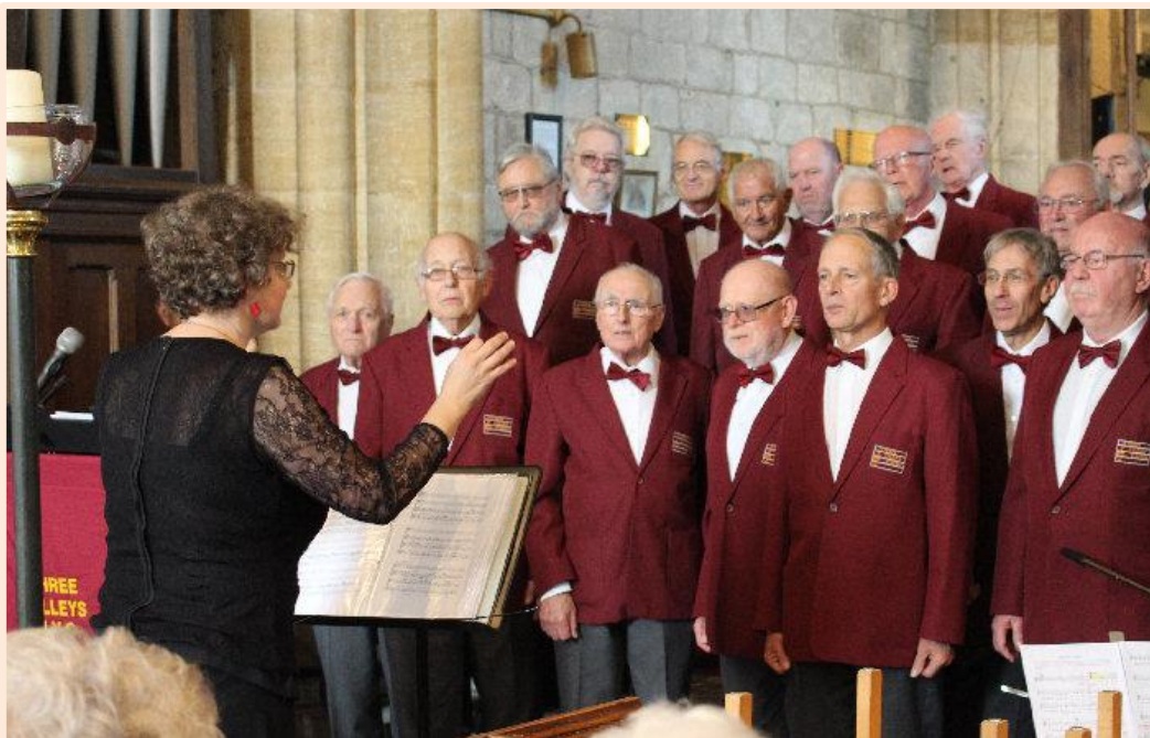
The Three Valleys Male Voice Choir has 28 members, and was formed in 1994. Based in