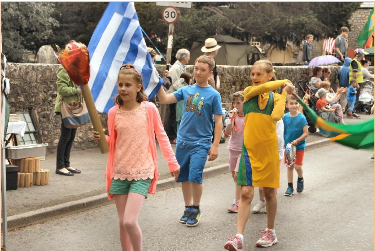
The 'Rio' theme for the Winsham Street Fair started with Winsham School parading the 'torch' down to where the opening ceremony was carried out. Fortunately, the rain held off for this part of the event.