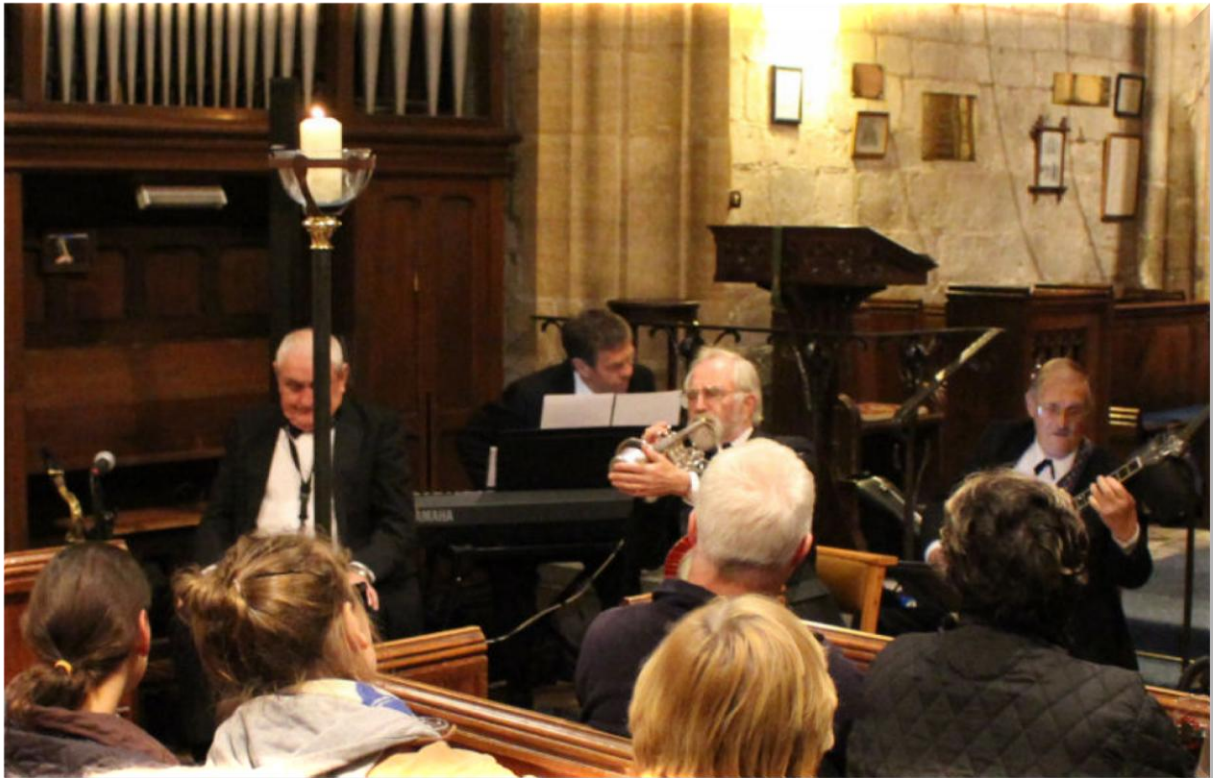
The Sunset Cafe Hot Four delighted an audience of about seventy at St.Stephen's on Friday evening.