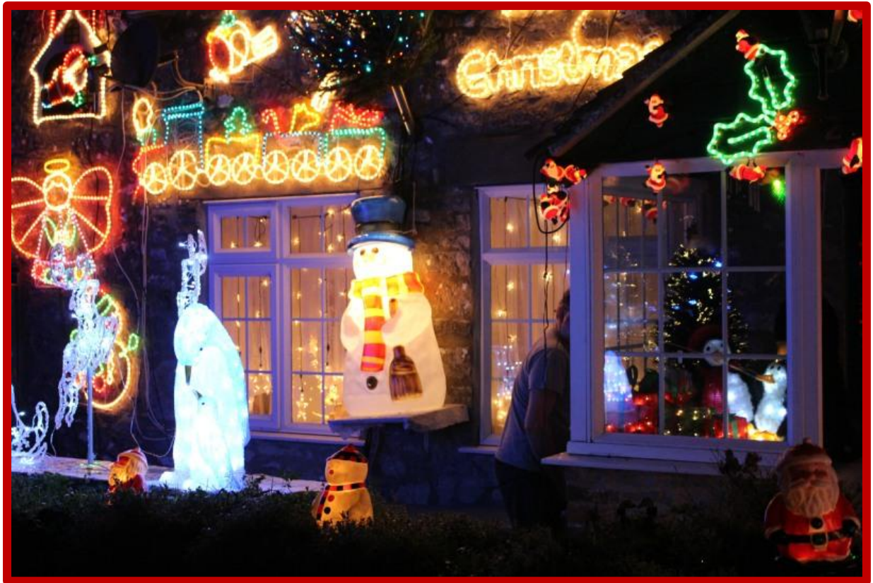
In one of the quietest parts of Winsham, at the end of Court Street, there is a small cottage, which at Halloween and Christmas regularly celebrates with a dazzling display of lights. This year there is even a 'snow maker'. Well worth a visit.