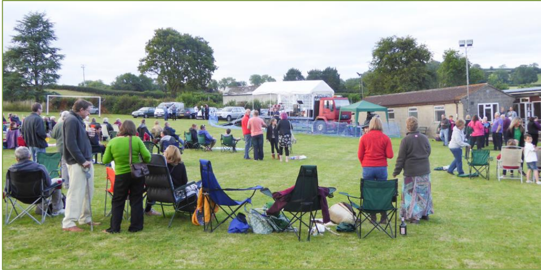
The 'Music in the Field' event organised by the Street Fair Committee was a great success, well supported by all age groups, and lot of fun. The weather stayed dry, the music was good-a very pleasant parish event.