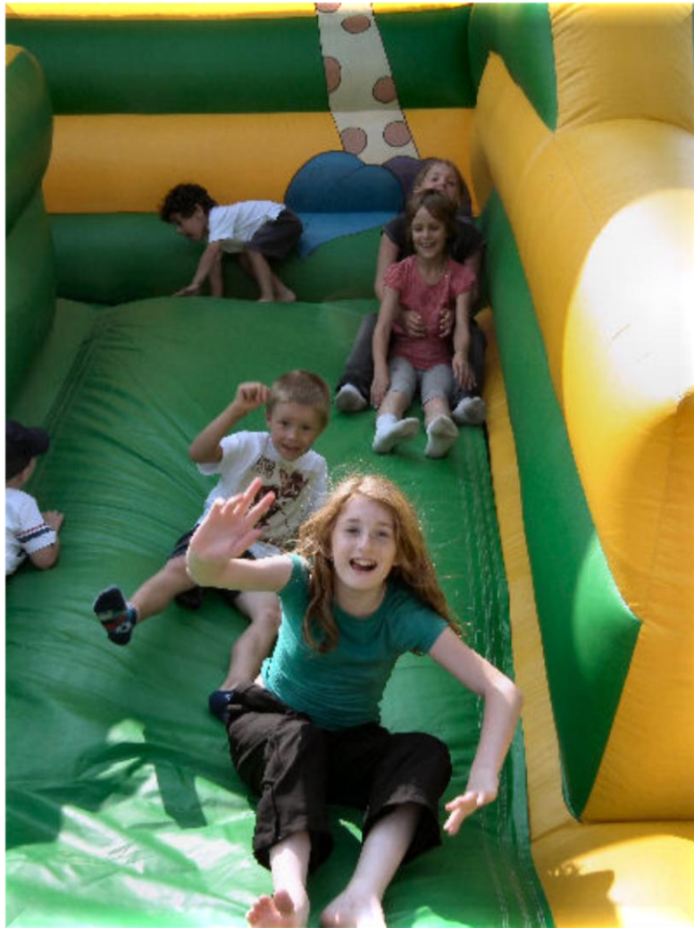
Lots of fun at the Bank Holiday Play Day on the Upper Rec.