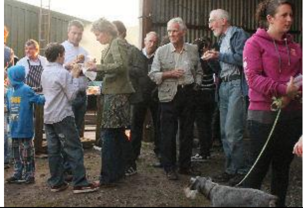
A great time was had by all who supported the Street Fair Committee's Barn Dance, held at Lime Kiln Farm yesterday evening.