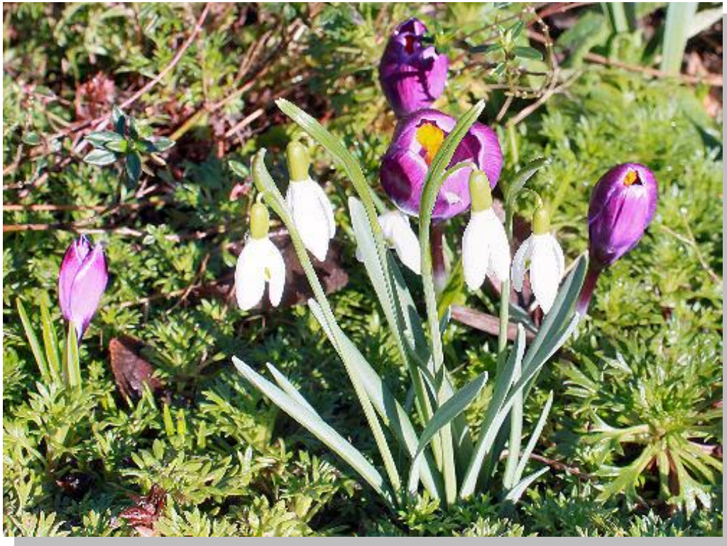
First signs of Spring?