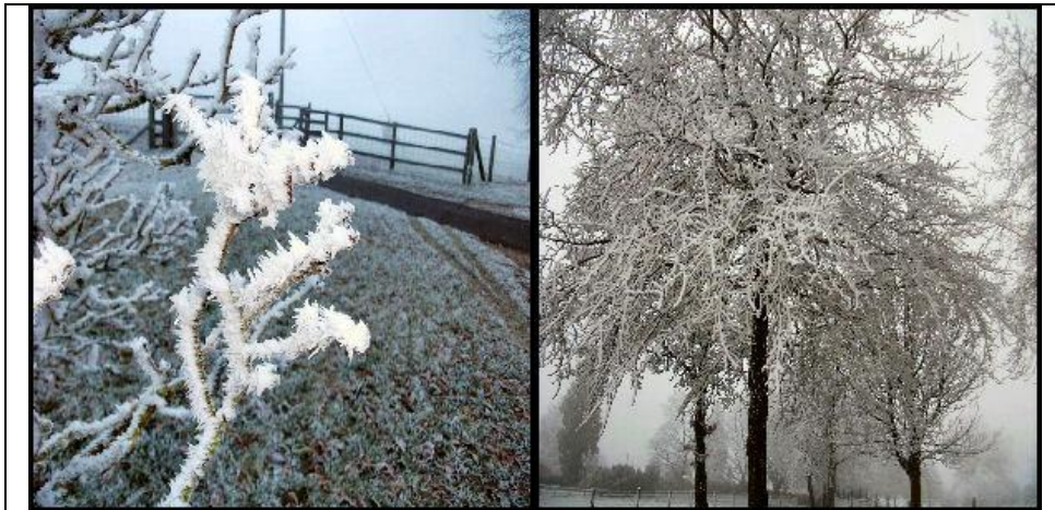
Very nice pictures from Tony at 'The Bell'