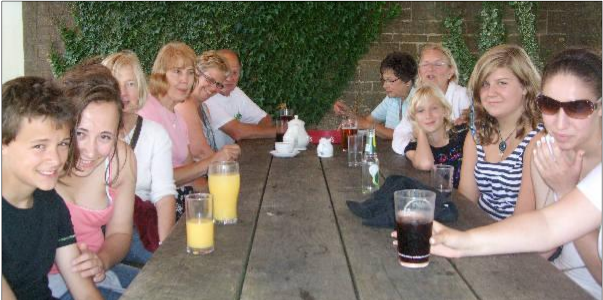
St.Stephen's organised trip to Exmouth last Sunday, and on Wednesday the Family Circle had a walk on Ham Hill.