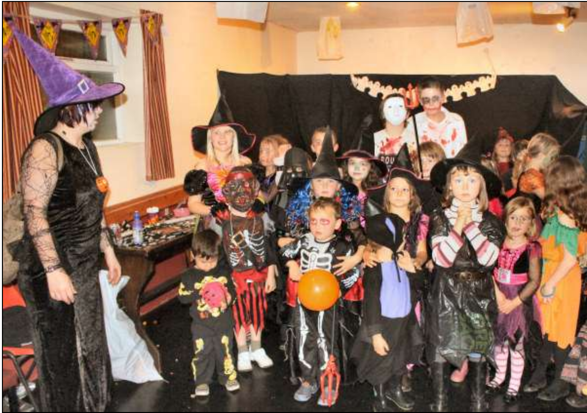
Little demons a' plenty. The Halloween Night Party at the Sports & Social Club on Friday evening was a great success. Click on link below for some super pictures.