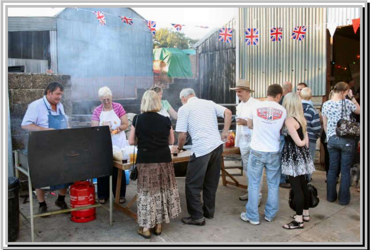
A great evening at Lime Kiln Farm for the Street Fair Barn Dance and BBQ, last Saturday evening