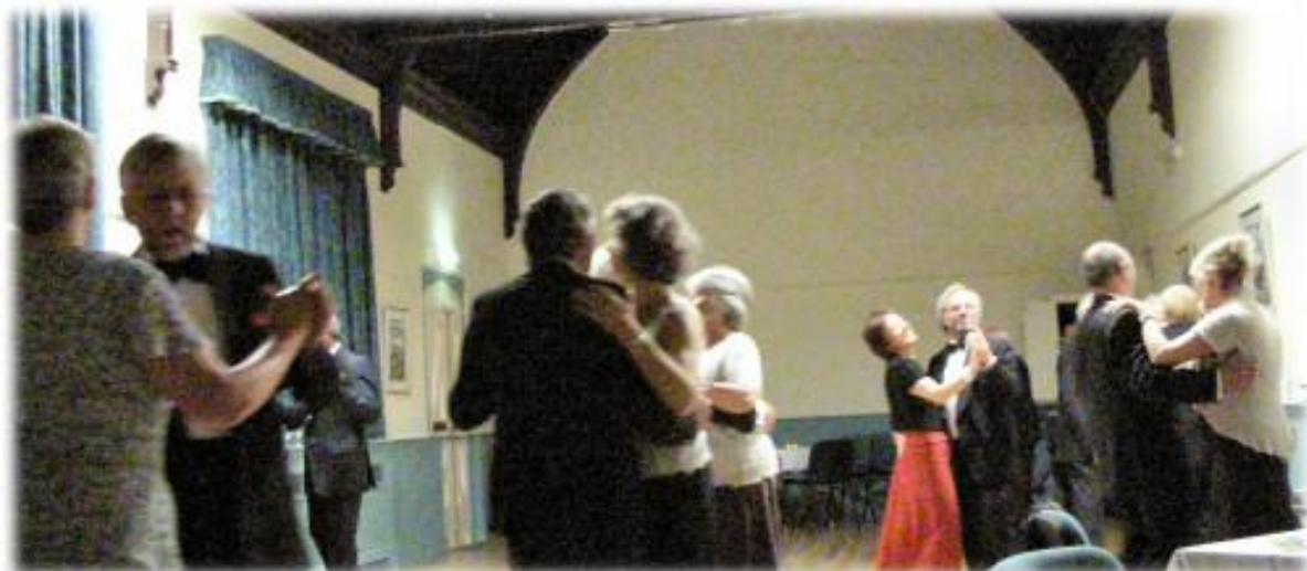
Winsham Dancers held a very successful dance on Friday 18 th May