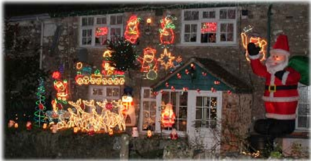
Christmas comes to Court Street with a magnificent display at No.1 Malhuses. Stretch your legs one evening and see for yourself.