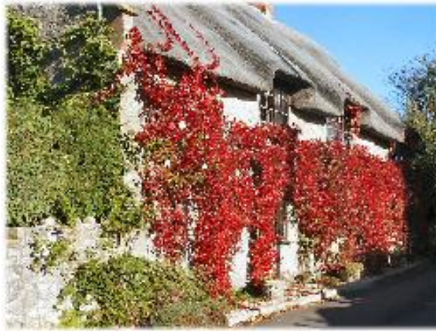
Autumn is a comin'